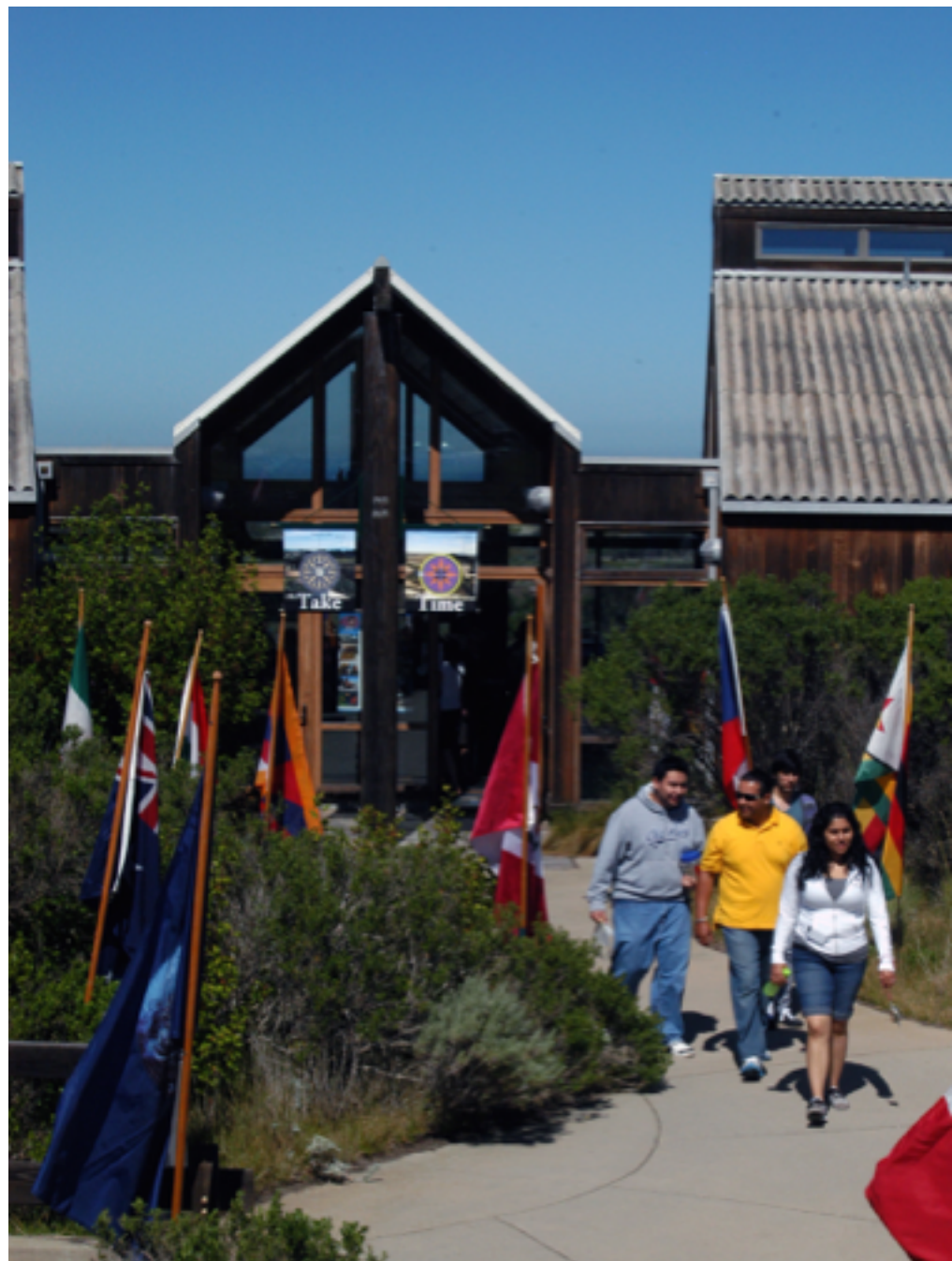
MLML's main entrance on a recent Open House weekend