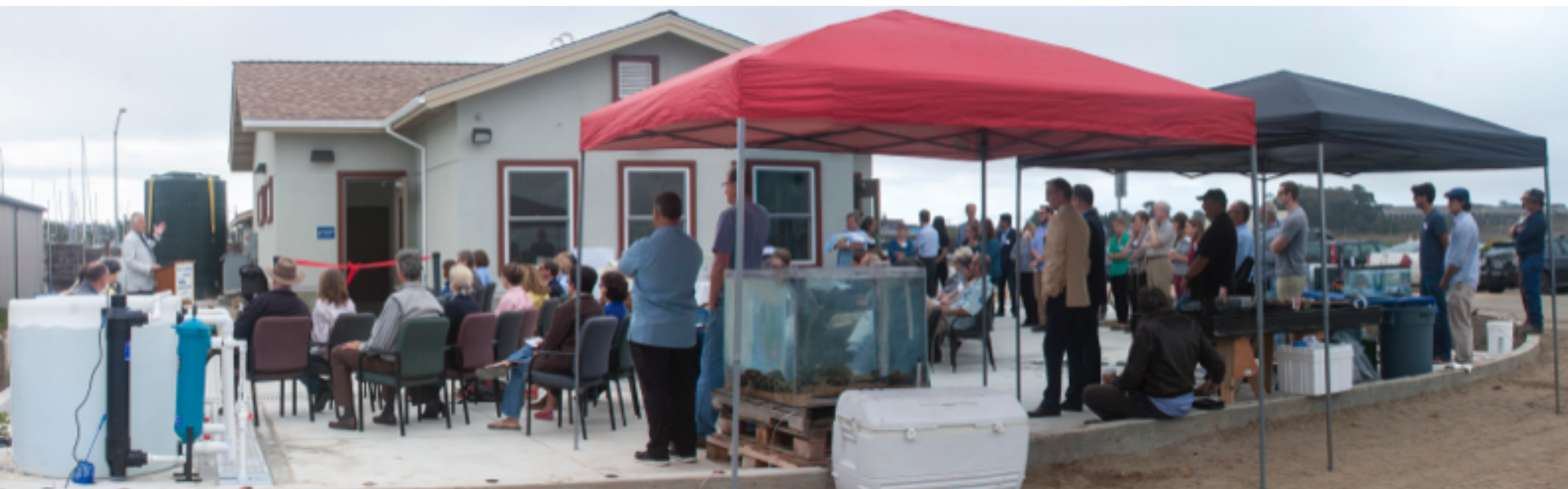
The Grand Opening ceremony of MLML's Aquaculture Facility, at MLML's Shore Lab Southern Complex, on August 22, 2014. Attendees from various scientific, business, academic, and community sectors enjoyed the event's aquaculture demonstrations and discussions. The Facility continues to attract both public and private interest, is experiencing increased pressure to accommodate additional research activities, and is expected to be revenue-generating in the future.

THE SHORE LAB NORTHERN COMPLEX is home to the Marine Pollution Studies Laboratories, Environmental Biotechnology Lab, Sea Lion Research/ Training Facilities, and offices for affiliated research staff and faculty. Researchers at this site have provided many student employment and thesis opportunities and bring in as much as $15 million/year in extramural contract and grant activity. The main building was converted in 2002 from a warehouse that used to house an engine repair business, surfboard manufacture, and an aquaculture company, to create the current office and lab spaces.