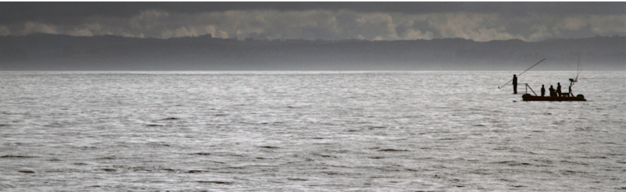
MLML graduate student Sharon Hsu captured this photo while working with MLML faculty and collaborators from local institutions tagging Humpback whales in the Monterey Bay.