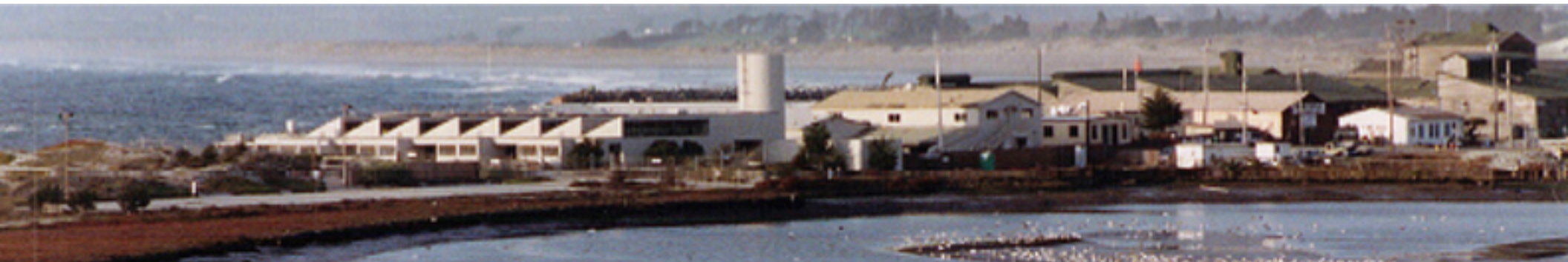
MLML's original location and facilities in Moss Landing, which were destroyed in the 1989 Loma Prieta Earthquake. Although the epicenter of the 6.9 magnitude quake was about 37 km to the north, liquifaction was enough to cause the foundation of our building to shift 1 meter towards the ocean.