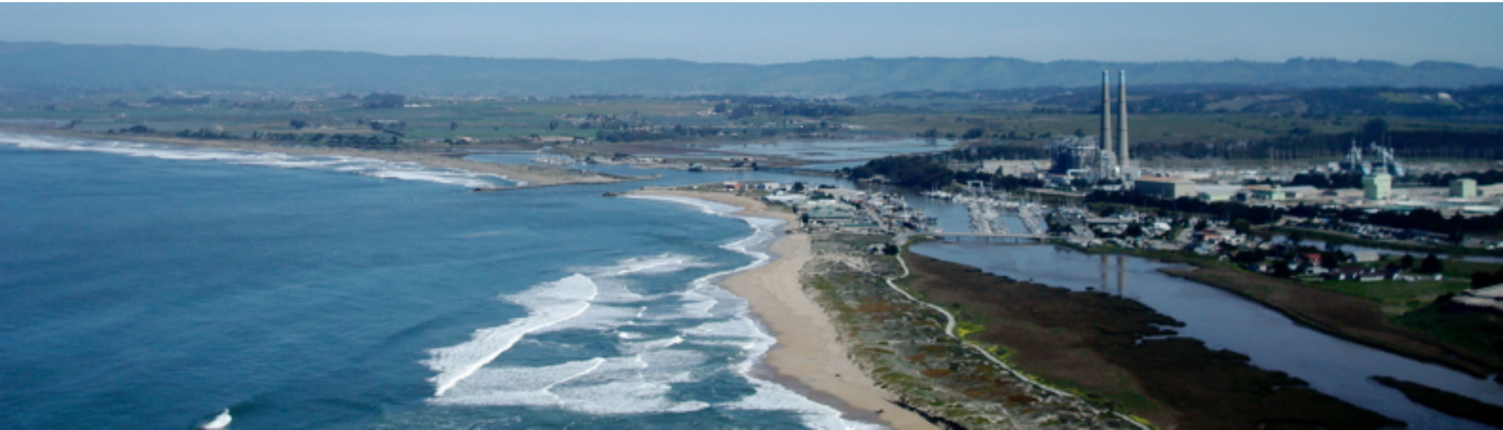
An aerial view of Moss Landing from the South, showing Moss Landing State Beach, the Moss Landing harbor channel and mouth of the Elkhorn Slough, and the Old Salinas River channel.

MLML/SJSURF is fortunate to have secured a firm institutional foothold on one of the richest and most diverse coastlines in North America.