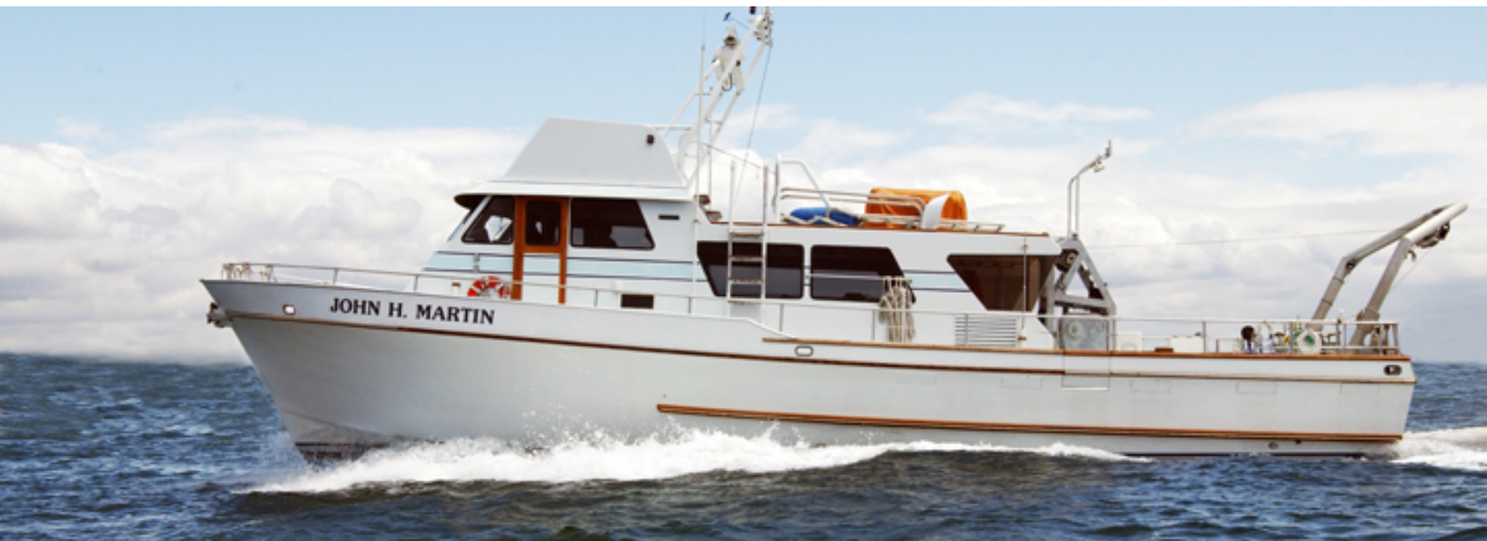
With the loss of the 135' R/V Point Sur , the 56' R/V John H. Martin is currently the largest vessel in MLML's Research Fleet.

GROUP II EQUIPMENT requirements for a marine lab are more intensive than for most other university departments. Not only is the normal suite of contemporary teaching equipment and facilities required, but sophisticated lab equipment and extensive field sampling and underwater or over-the-side equipment are also necessary. Specialized library resources are required to help interpret new findings. Fabrication capabilities are needed to develop innovative tools for the marine environment. Toward this end, MLML has a successful track record of grant funding for equipment through NSF MRI and FSML, ONR DURIP, Federal Surplus, and private foundation initiatives. Such awards have enabled the acquisition of the mobile Library shelving, ICPMS, Main Lab computer network, Scanning Electron Microscope, Research Flume, Laser Particle Sizer, SCUBA air and Nitrox compressor, and some machine equipment.