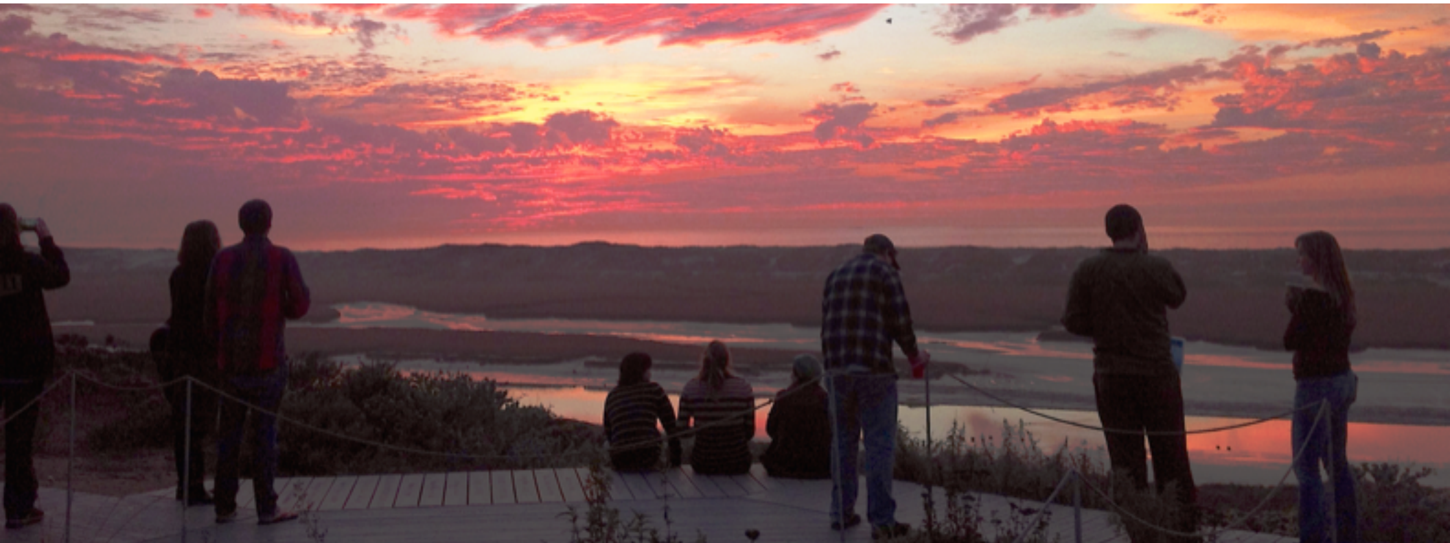
MLML students, staff, and faculty enjoying a sunset over the Monterey Bay together on the boardwalk of MLML's main facility