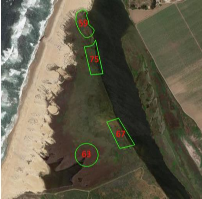
Figure 2. CRAM Index scores for each Assessment Area in the Salinas River lagoon. Site 1 scored in the “fair” category, while the remaining sites scored in the “good” category.