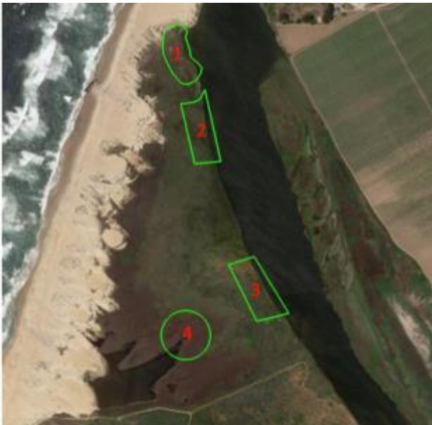
Figure 1. CRAM Assessment Area locations for the Salinas River lagoon completed in October 2012 (1 & 3) and June 2015 (2 & 4).

CCWG conducted four CRAM assessments in October 2012 and June 2015 (Figure 1).