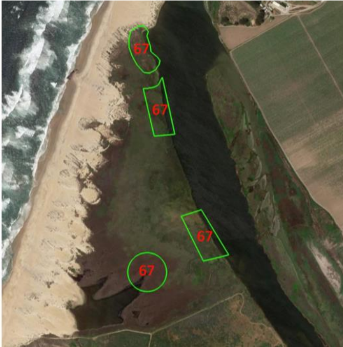
Figure 4. Hydrology Attribute scores for each Assessment Area for the Salinas River lagoon.

The Physical Structure Attribute received an average score of 44, ranging from 38 to 63. The majority of the sites received a score in the “poor” condition category due to a low number of physical patch types observed in the assessment areas and a lack of topographic complexity across the marsh plain.