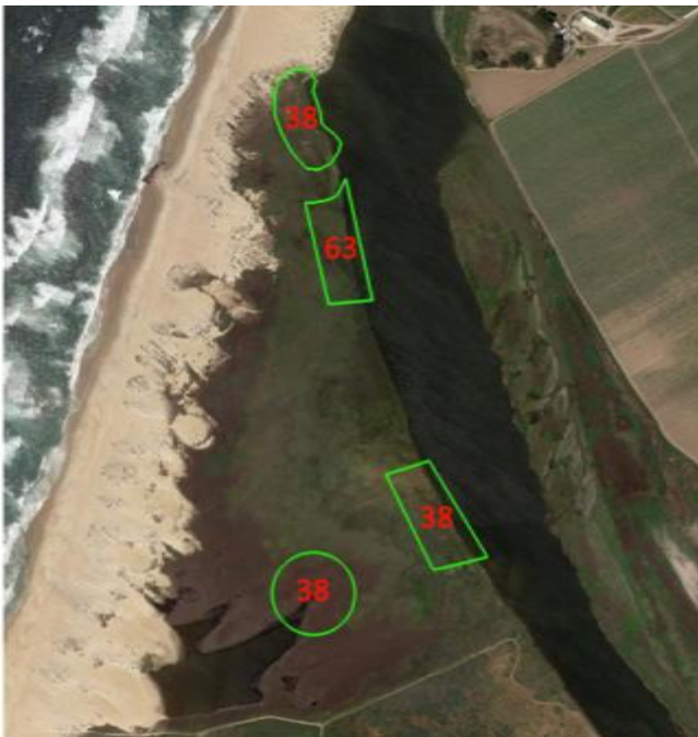
Figure 5. Physical Structure Attribute scores for each Assessment Area for the Salinas River lagoon.

The Physical Structure Attribute received an average score of 44, ranging from 38 to 63. The majority of the sites received a score in the “poor” condition category due to a low number of physical patch types observed in the assessment areas and a lack of topographic complexity across the marsh plain.