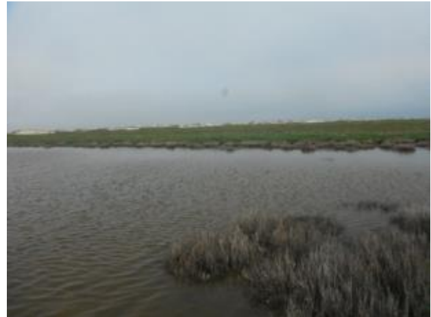
Photos from the Salinas River Lagoon CRAM assessments.