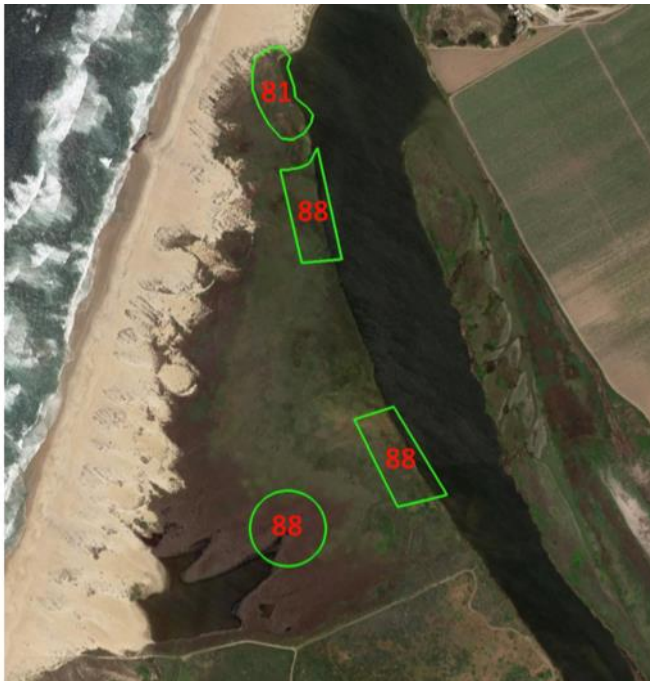
Figure 3. Buffer and Landscape Attribute scores for each Assessment Area for the Salinas River lagoon.

All four assessment areas received a good condition score of 67 for the Hydrology Attribute (Figure 4). The reason for the lack of variability is due to the design of the metrics and what they assess. All three metrics look at landscape level indicators of condition, so all assessment areas in a system will most often receive the same score. The assessment areas scored low for the water source metric due to the high amount of agricultural land use in the immediate watershed. The Hydroperiod metric, which looks at the breaching pattern of the mouth, received a moderate score. The Hydrologic Connectivity metric also received a moderate score due to the presence of some levees within the system, restricting the spread of rising floodwaters up a natural transition zone from wetland to upland.